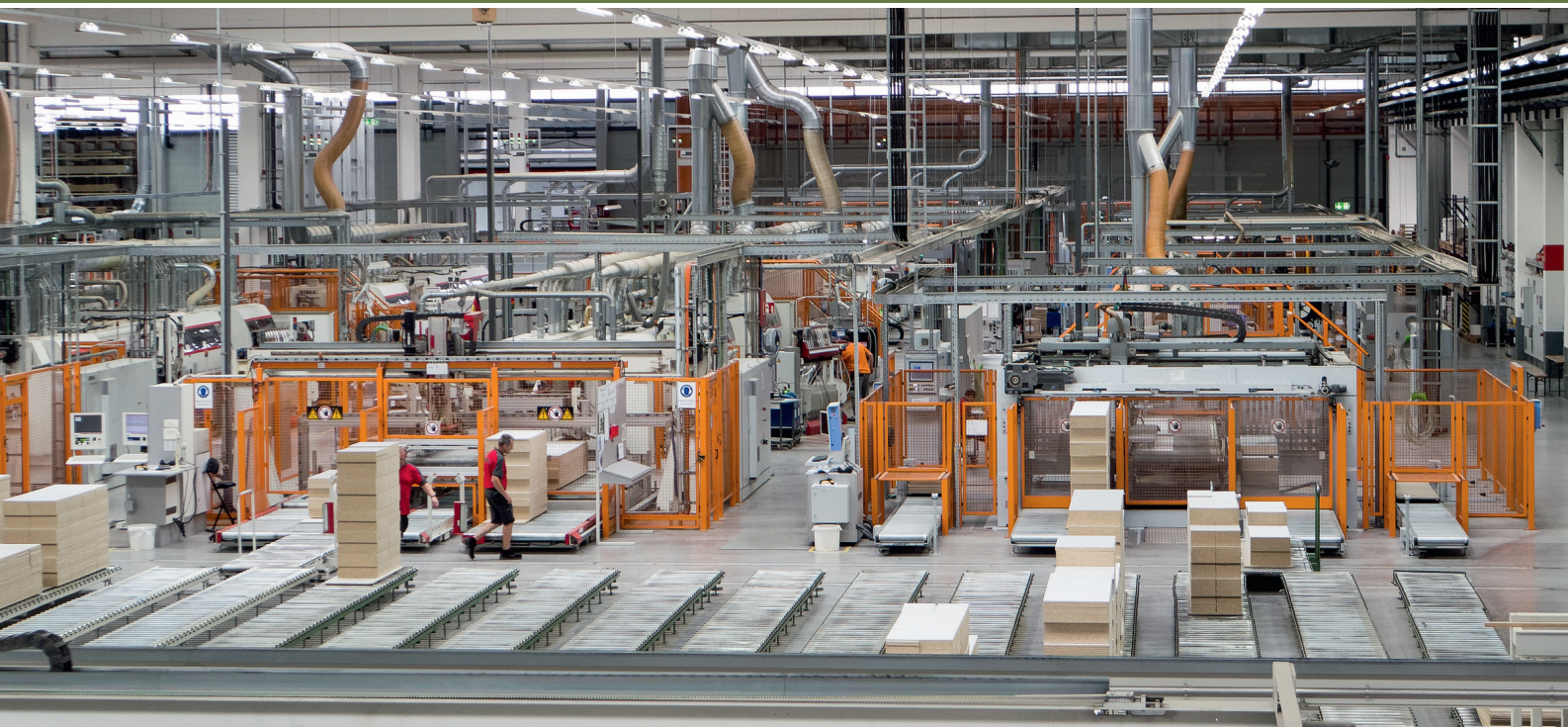
Schueller has equipped all machine lines with the width-adjustable jointing cutter including the service in manufacturer quality

ging strip as unpleasant. When the subject of zero joints arose almost ten years ago, Schueller equipped all machines with jointing cutters. This resulted in frequent and time-consuming tool changes. The