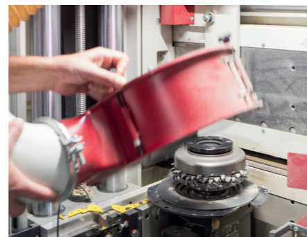
To reposition the cutting edges, the dusthood must be released