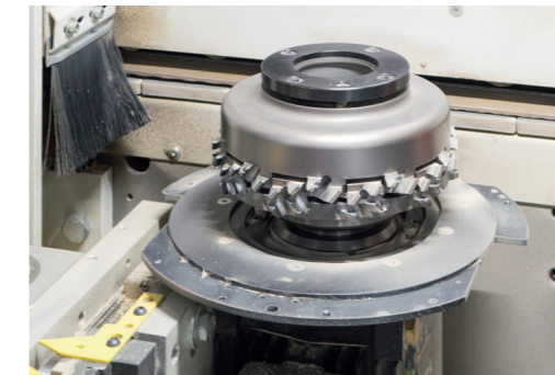
The jointing cutter is exposed and can be easily adjusted from above with the Allen key