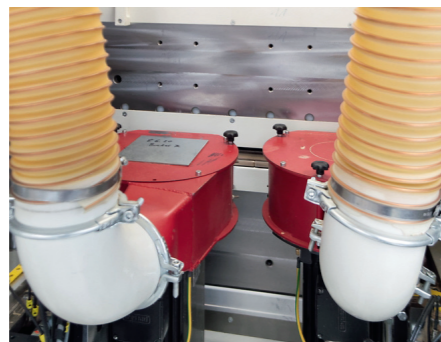
... the second and third jointing cutter in „with feed“ direction for 16 or 19 mm front panels