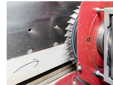
Hoggers remove the bulk of the material and relieve the jointing cutters