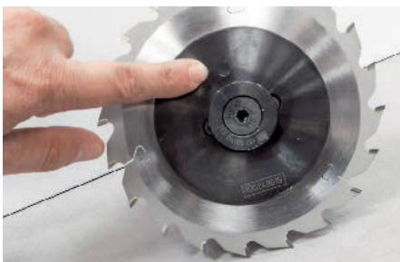
An RFID chip for future data exchange

Tool: Leitz GmbH & Co. KG 73447 Oberkochen, Germany www.leitz.org