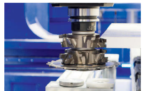
The triple tool on the CNC