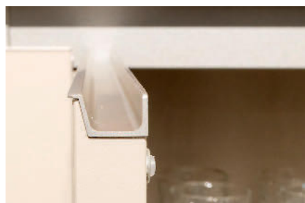
This aluminium grip bar has to be milled