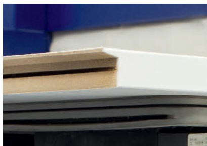
One tool is enough for this profile