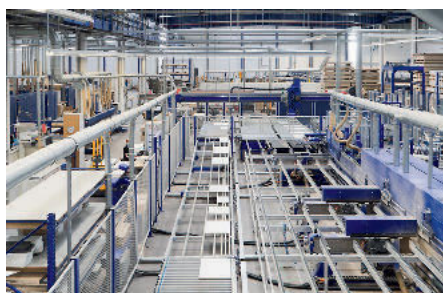
Fully automatic batch size 1 carcass line